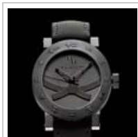
Black Belt Watch